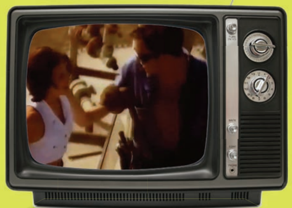
"1993 BODYFORM " ADVERT

This newfound agency of women aligns with the rise of third way feminism, a movement popularised by the Spice Girls who stood for an assertive and care-free version of womanhood - one that reclaimed what it meant to be "girly". Women began to prioritise instant gratification over progress. Mentions of "sexy" peaked in 1988 and 1992 on Coronation Street reflecting how physical appearance and sexualising one another was entering everyday language.