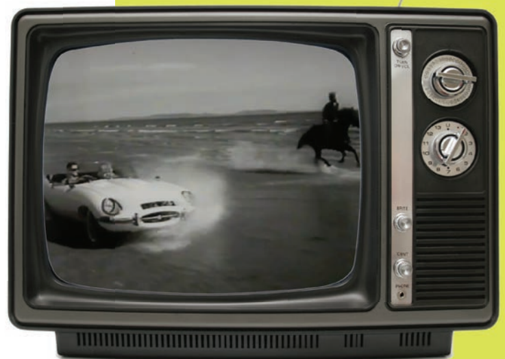
"NATIONAL BENZOLE PETROL" ADVERT

However it wasn't just how you looked it was about what you as a couple represented – your social power and status. This National Benzole Petrol ad sees a couple in a convertible racing a woman on a horse speeding down a beach in a scene that could be from a movie. Being a couple was worn like a badge of social power and these ads signal that a man and woman needed each other to thrive, their roles were distinct and purposeful.